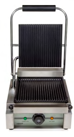
Contact grill, ribbed 90009 1,8kW/ 230V/ 1phase