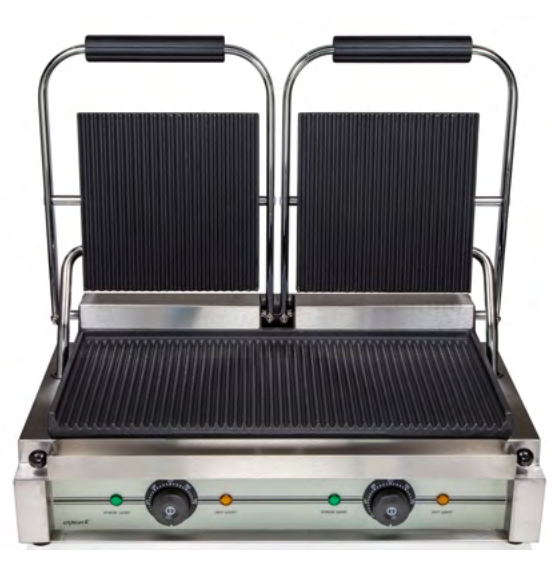
Contact grill double, ribbed 90017 3,6kW/ 230V/1 phase/ 16A